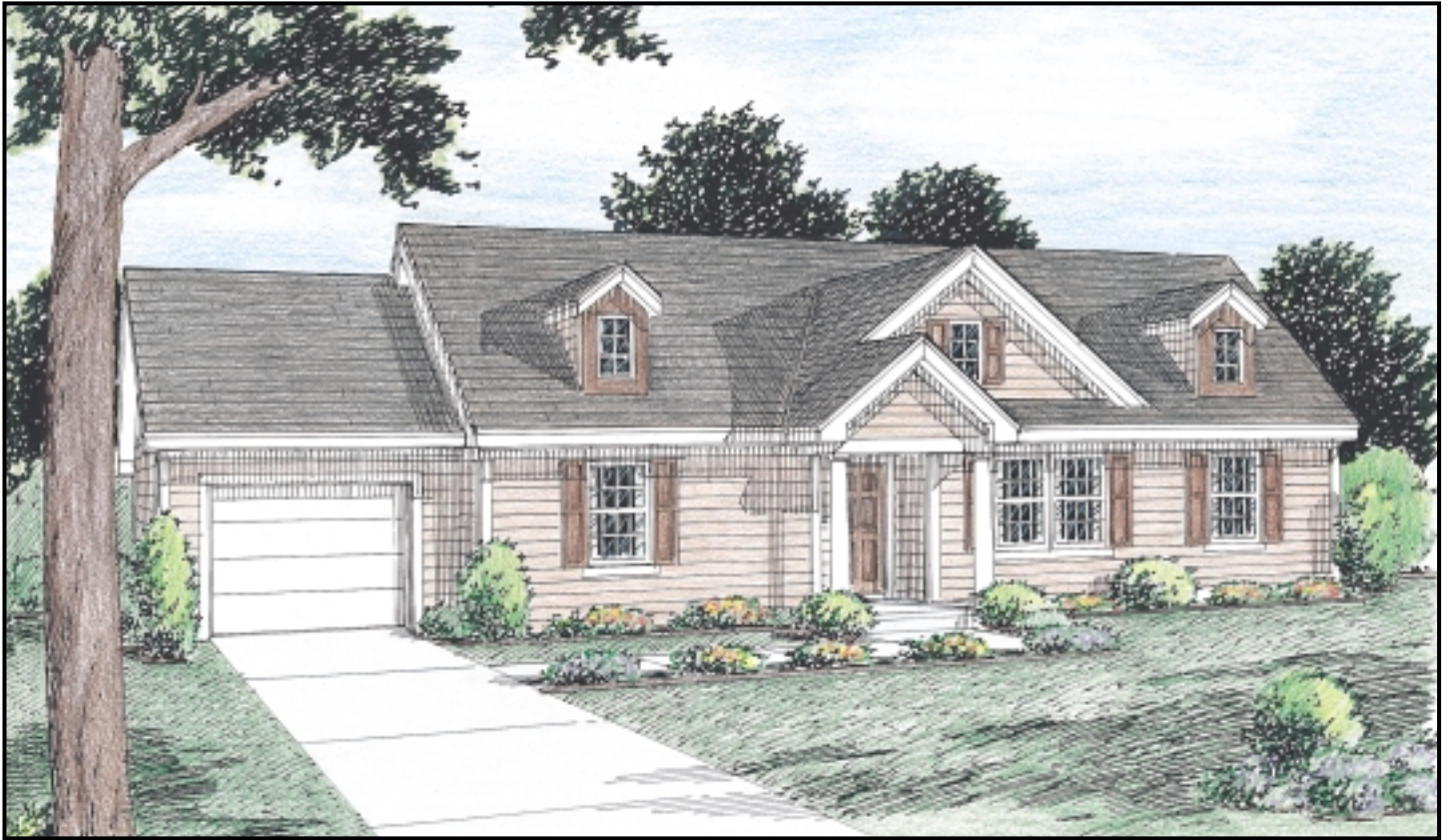
Renderings are for illustration purposes only and may vary in precise detail from plans and specifications.